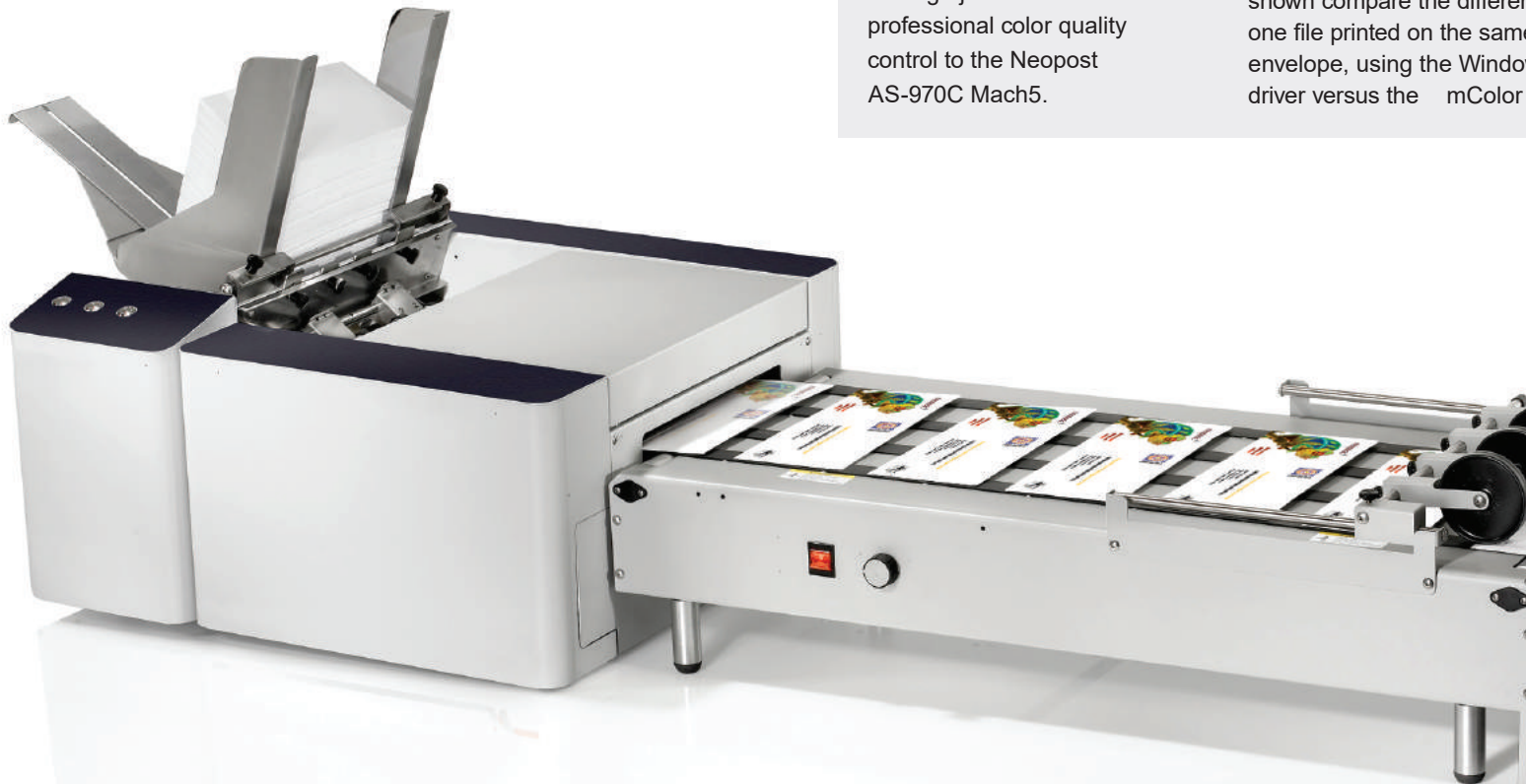
AS-970C Mach5 presented with optional conveyor stacker (CS870)