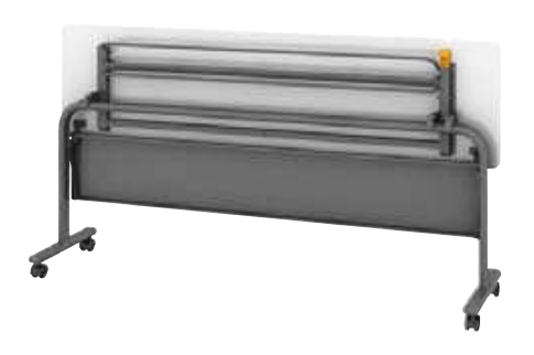
Easy Folding, Easy Moving.