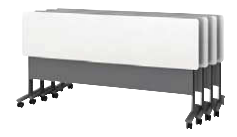
Folding tabletop can be stored in limited space.