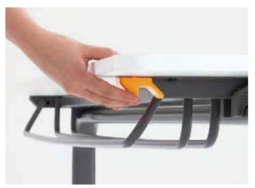
Just pull the lever on the right side to fold the table.